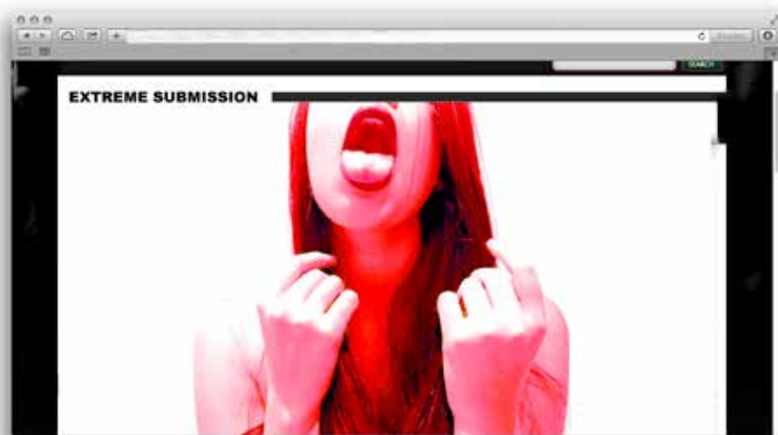
shawné michaelain holloway: Extreme Submission, March 17