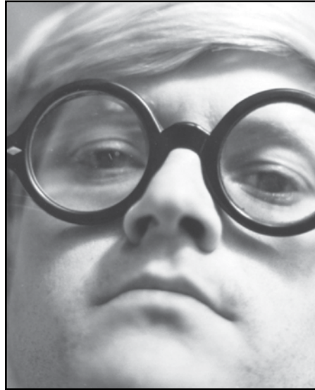
HOCKNEY, March 26, 28

From the shipbuilding banks of the Clyde to the highlands and the Hebrides, there is nary a tartan-tinged cliché in this haunting portrait of Scotland's twentieth century, composed entirely of archival footage from Scottish film archives. No dialogue; music by King Creosote. (BS)