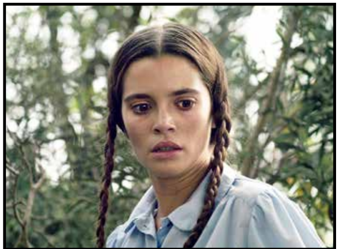
AT AN UNCERTAIN TIME , March 26, 31