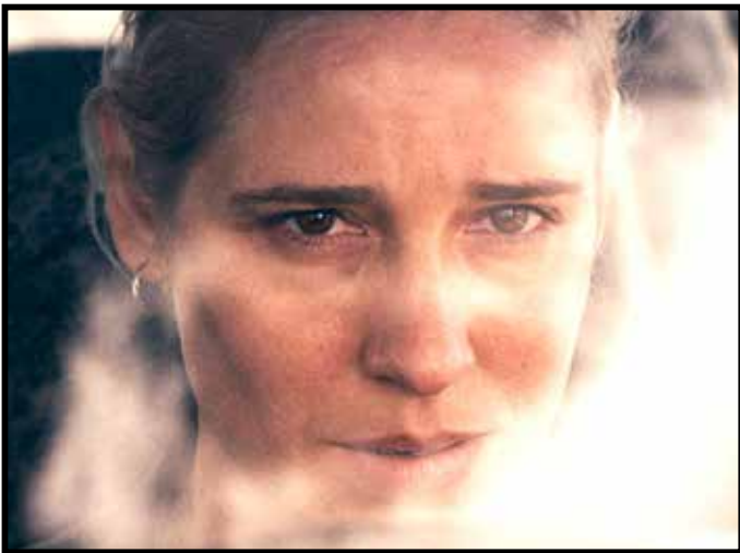
A BLAST, March 19, 21