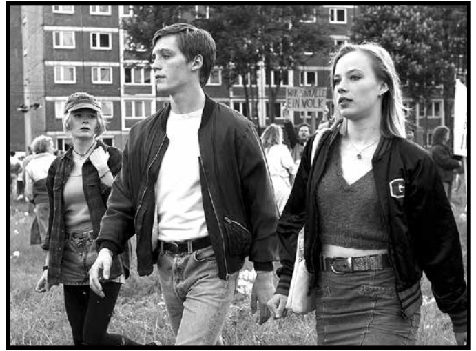
WE ARE YOUNG. WE ARE STRONG, March 27, 30