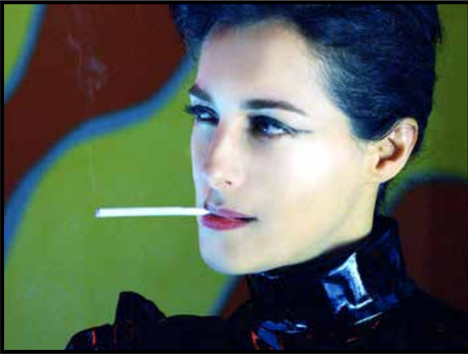
THE LAST SUMMER OF THE RICH, March 25, 29