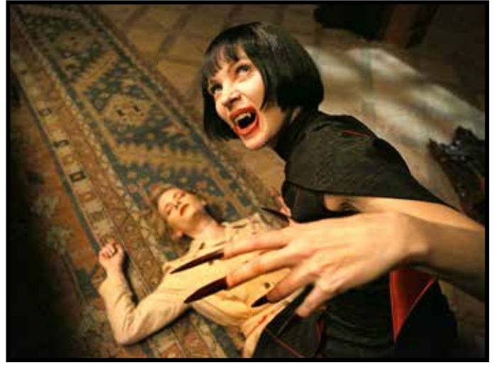
THERAPY FOR A VAMPIRE, March 19, 24