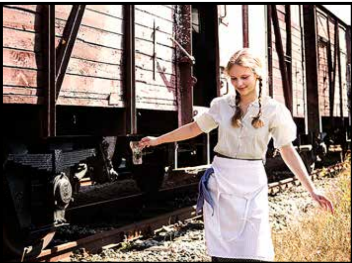
SUMMER SOLSTICE , March 12, 16