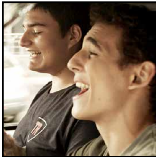
NOTHING IN RETURN, March 17, 18

Winner of ten Goya awards (including Best Picture, Director, Actor), this atmospheric, politically charged thriller, set in 1980, brings two Madrid cops to the Andalusian hinterlands to investigate the disappearance of two teenage girls. In Spanish with English subtitles. (MR)