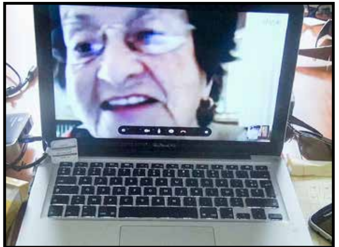
NO HOME MOVIE, March 19