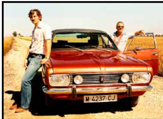
MARSHLAND, March 6, 7

In this sprightly meta-movie, an Argentinian screenwriter is hired to pen a Madrid-set rom-com, but, as he becomes increasingly aware of the contrast with his own troubled marriage, his real and fictional worlds begin to merge. In Spanish with English subtitles. (MR)