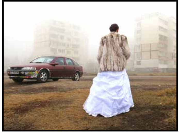
HEARTS KNOW* THE RUNAWAY BRIDES , March 27, 28