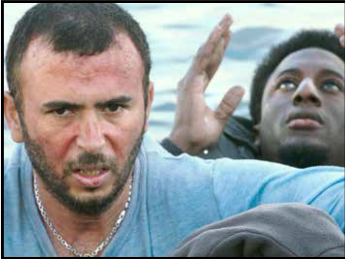
SIMSHAR , March 9, 14