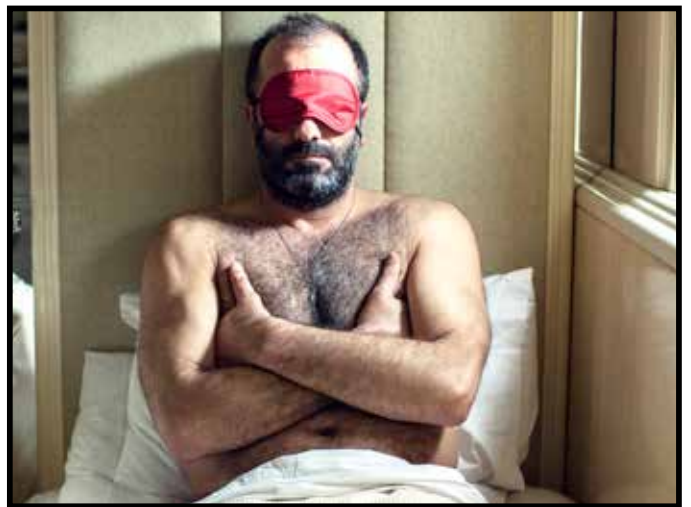
CHEVALIER, March 25, 28