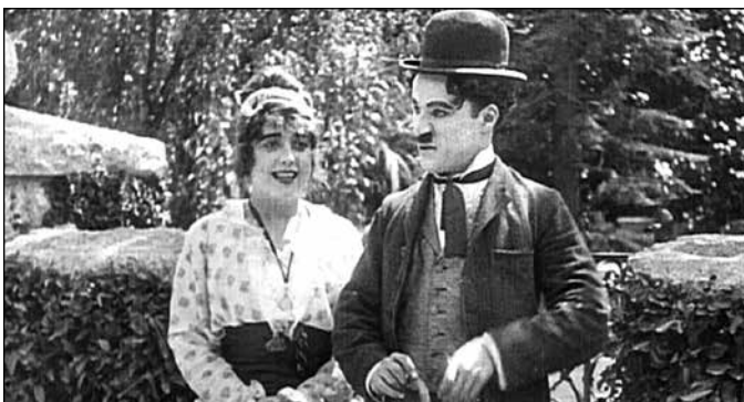
CAUGHT IN A CABARET

Best known for its use of an unclothed woman to represent Truth, Lois Weber's boldly unconventional, multileveled allegory employs two time frames, an extended dream sequence, elaborate camera movements, and a final ironic twist to tell the parallel stories of a medieval monk and a modern-day minister who struggle against the hypocrisy of their times. Preceded by two Weber shorts: SUSPENSE (1913, 12 min.) and THE ROSARY (1913, 15 min.). All in DCP digital with prerecorded music scores. (MR)