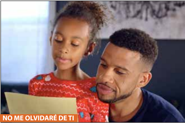
NO ME OLVIDARÉ DE TI