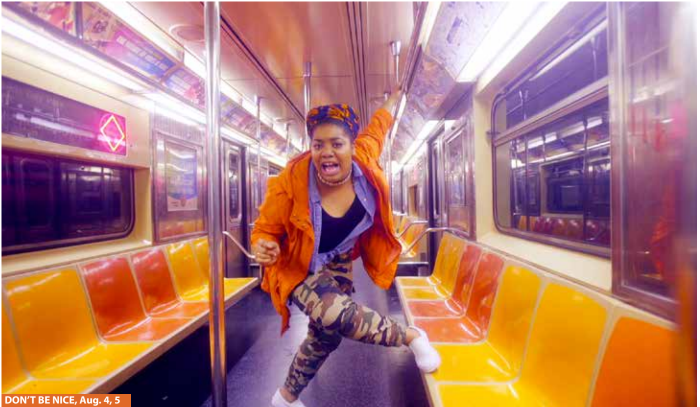
DON'T BE NICE, Aug. 4, 5

From August 3 through 29, the Gene Siskel Film Center welcomes you to the 25th Anniversary Black Harvest Film Festival . Your support of films celebrating Black life, stories, and culture has brought us to this milestone year! Our anniversary festival presents a bountiful harvest of seventeen new feature films, forty-plus short films, and personal appearances by more than forty filmmakers.