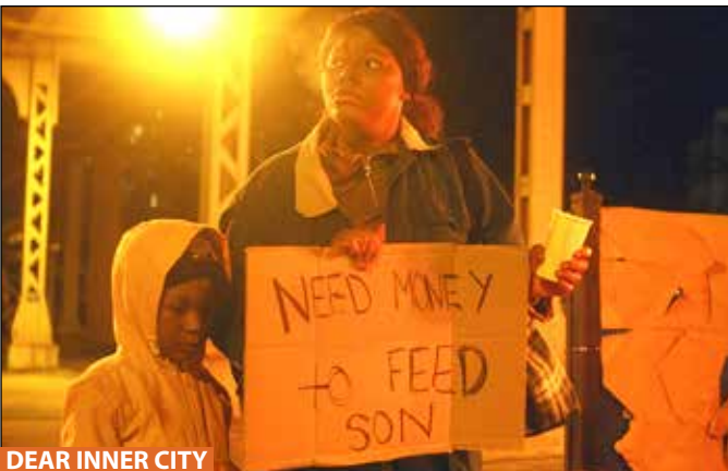
DEAR INNER CITY