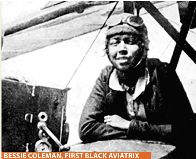
BESSIE COLEMAN, FIRST BLACK AVIATRIX

Join us for the Gene Siskel Film Center Movie Club, which will include a post-screening conversation and a complimentary beverage.