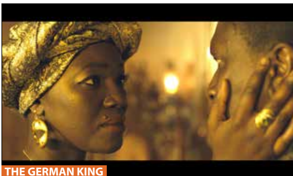
THE GERMAN KING