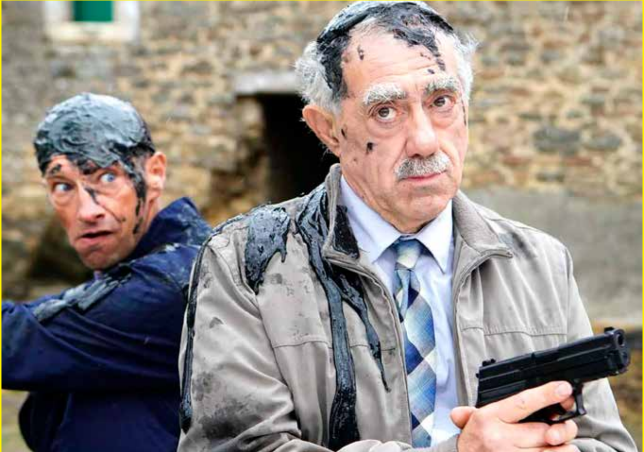
COINCOIN AND THE EXTRA-HUMANS (France), March 23, 28