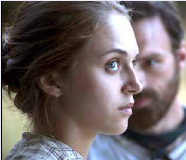
THE SOWER (France)