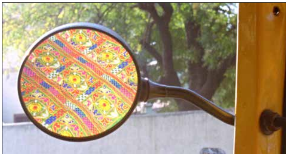
THE GRAND BIZARRE, Feb. 7